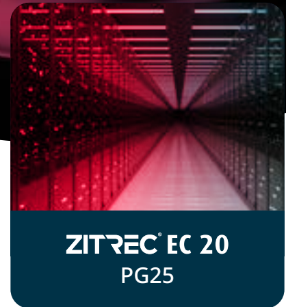
ZITREC® EC 20 PG25

ZITREC® EC 20 is a premium ready to use PG25 direct-to-chip liquid coolant based on patented OAT-technology customised for data centers and other electronic applications.